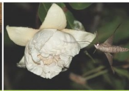
HAWK-MOTH (PYLSTERTMOT) WITH BAOBAB FLOWER